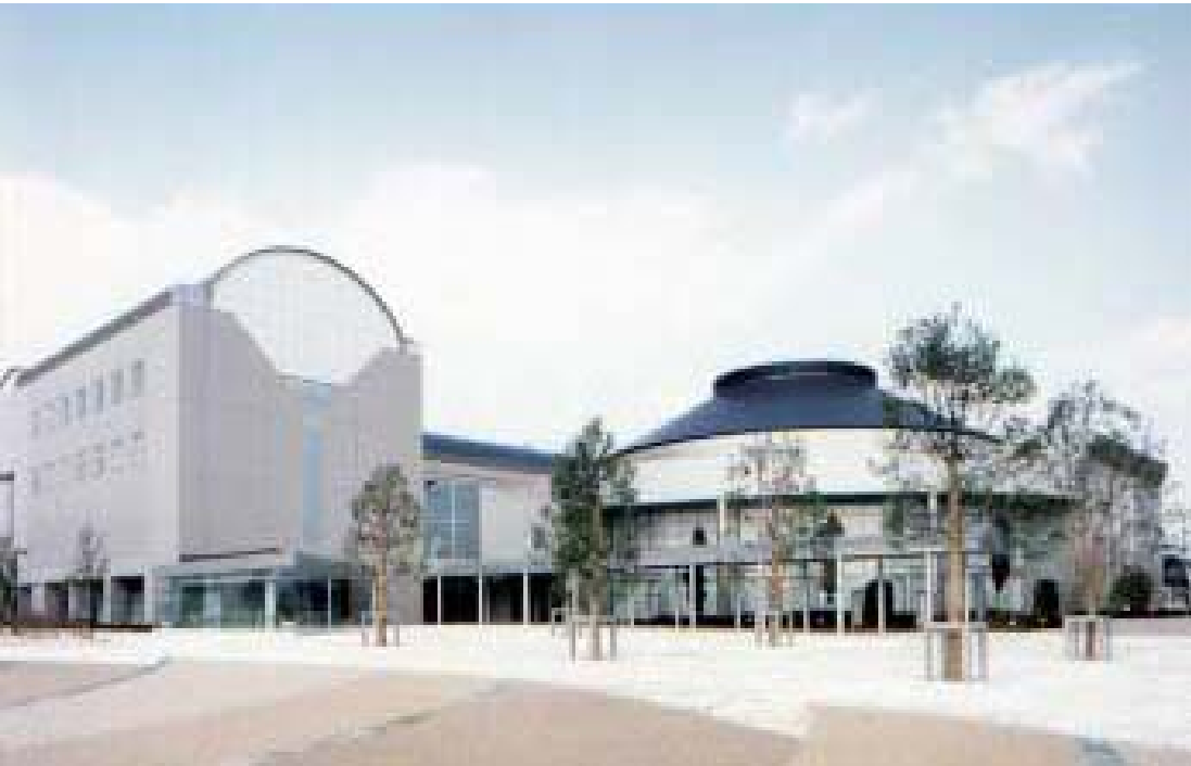
The building on the outside