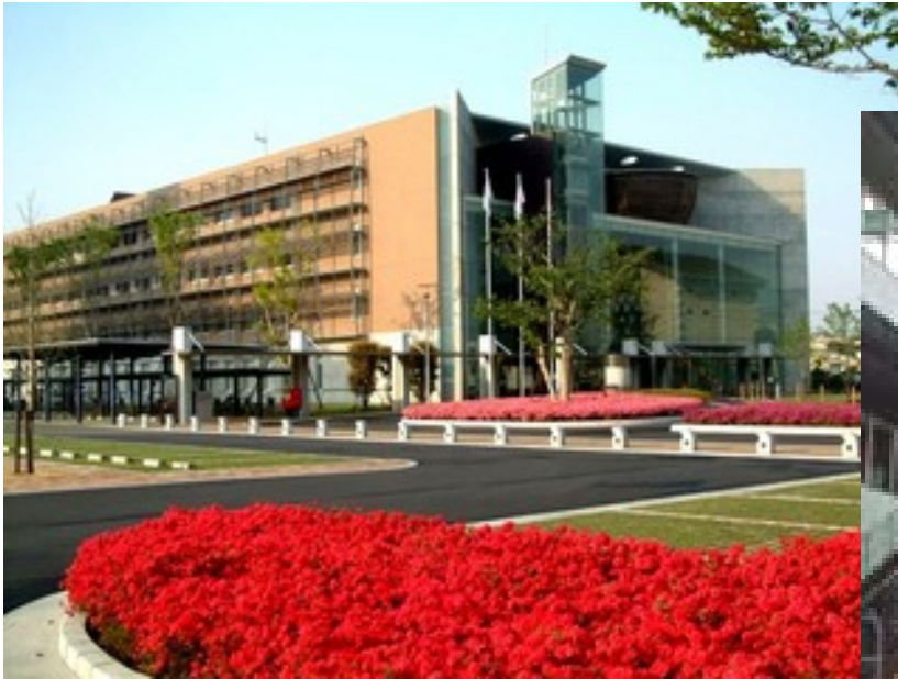
The building on the outside